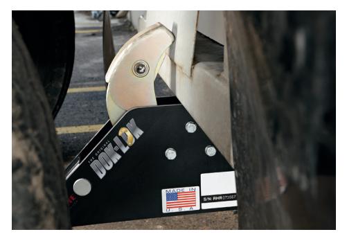
Shadow hook secures intermodal container chassis with rear impact guard obstructions.