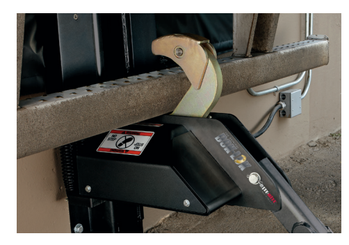
Unique rotating hook delivers the highest level of protection.

Stores above ground away from snow, ice, debris and standing water to ensure reliable performance. IP66 rated motor helps prevent dust and water infiltration. Resists damage by backing trailers. Corrosion resistant finish for all-weather performance.