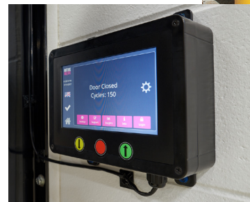
Graphic User Interface (GUI)

More than just sensors and data, the Opti-Vu™ platform monitors equipment, captures events, synchronizes vital information and facilitates data-driven behavioral and process change (subscription & additional hardware required).